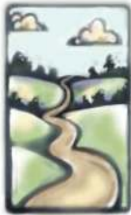
Planning for the Future

Each of the ministries are going to be looking at what we would like to be 5 or 10 years down the road and how we may to plan for the physical assets we have may need to change to service those future needs. This is not an easy process. It is hard to tell the future and so many things can change along the way. We will need to put plans in place that are focused enough to give direction yet flexible enough to be able to shift as the needs become clearer. Please be a participant as we begin this journey.